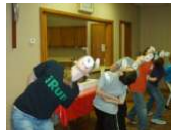
Donut eating contest

Thank-you to Liturgy Members for cooking and to all who served/cleaned up in February. We couldn't do it without your help!