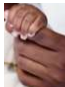
Take my hand not my life...

Birthright Center in Pierre: Birthright believes it is the right of every pregnant woman to give birth and the right of every baby to be born. Birthright has been in Pierre for many years and at the present time it is in need of volunteers . Center hours need to be increased to reach and be available for more women. They are looking for are committed pro-life people, who would like to do more. If you are interested in helping women, please prayerfully consider volunteering a couple hours a week or month. A hotline number for anyone to call, is available at all times, though it could be improved through more access locally.